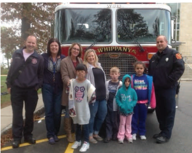
Left: Class 301 thank our community firefighters. Right: Students take turns using the fire hose.