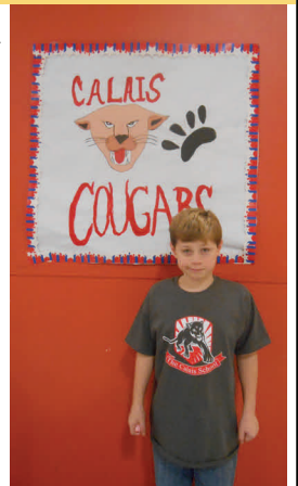
Left and above: Students show off their Calais gear.