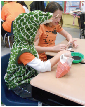
Top and bottom left: Student mentors help out in the Lower School classrooms. Right: High school students enjoyed a Halloween dance.