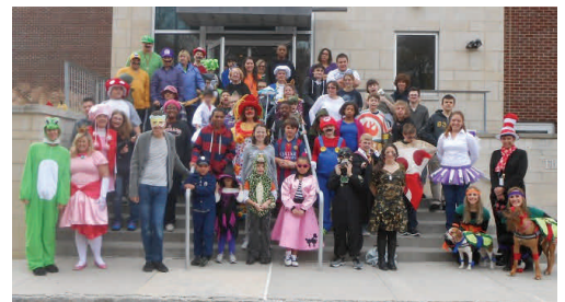
Right: New and returning students and staff came together during our annual Halloween parade at The Calais School.

We are also happy to announce a newly-designed website for The Calais School. The website will be up and running in early December and will still be hosted at www.thecalaischool.org . The new website will have a special parents-only section, the Parent Portal, which will feature what is going on in the classroom, including test dates, special projects, and homework assignments. The Main Office will send home more information about the Parent Portal in the coming weeks, so please keep checking back!